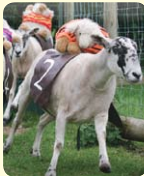
Sheepstakes Sheep Racing

Created for children, our demonstrations and shows are both fascinating and entertaining. Discover the agility of birds of prey in the stunning 'Bird-o-batics' Falconry Displays, watch Willows Sheepstakes to see which of our woolly friends is first to cross the finishing line or catch Willows sheepdog in our hilarious Daft Duck Trials!