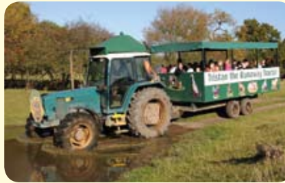
Tristan the Runaway Tractor

Learning through discovery is just one of the reasons to book your group visit to Willows Farm Village. With so many children growing up in urban areas, a visit to Willows allows young minds to explore the countryside, its animals, where the food they eat comes from, how animals and humans work together and the important of outdoor activity. And at Willows the children learn all this and more through our activity sheets, informative guides,* adventure play and having fun!